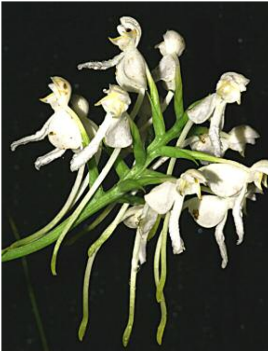
Monkey-face orchid ( Platanthera integrilabia )

were all showing signs of browning at some point along each raceme. Nevertheless, portions of some were photogenic.