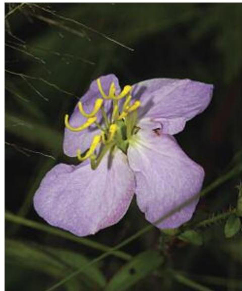
Maryland Meadow Beauty ( Rhexia mariana )

up with on the target list was yellow fringeless orchid ( Platanthera integra ). Oh well, an excuse for a future visit.