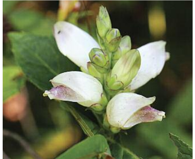
Chelone glabra, photographed on annual meeting trip

Our annual meeting, which was a joint affair with the Kentucky Native Plant Society, was a great success. Over 60 people were in attendance with Lake Barkley State Park providing a spectacular backdrop. We were treated to two